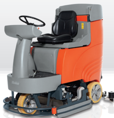
Scrubmaster B115 R cylindrical brush (WB)