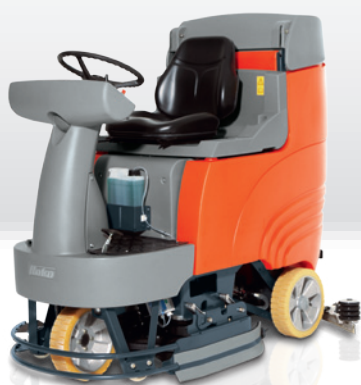
Scrubmaster B115 R plate brush (TB)