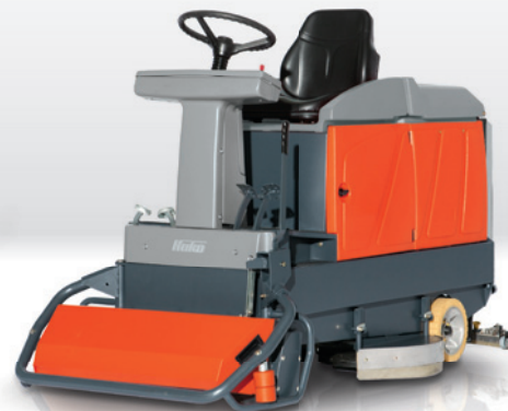
Scrubmaster B140 R with optional pre-sweep