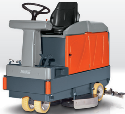
Scrubmaster B140 R