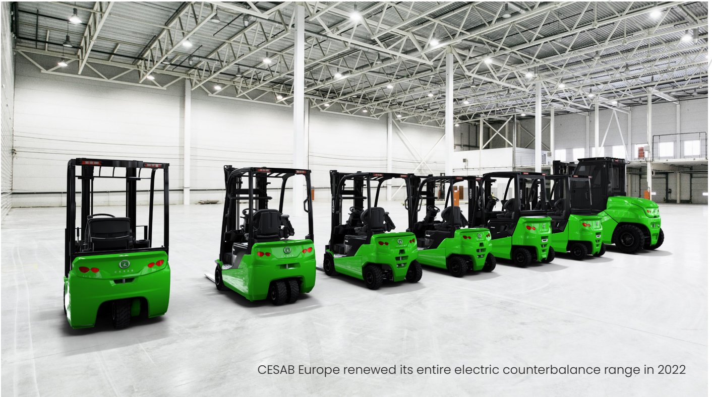
CESAB Europe renewed its entire electric counterbalance range in 2022