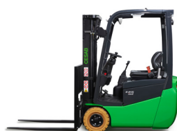
B210 1,0t @ LC 500